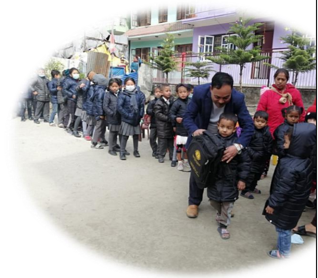
Children lining up after receiving Jacket