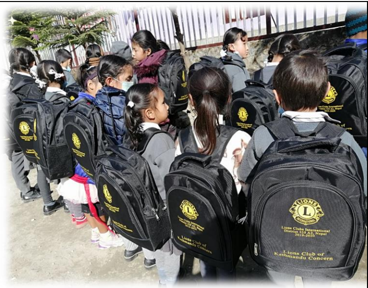
Kids lining up after receiving backpack