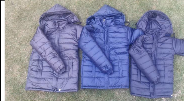
Jackets Turned out to be Great