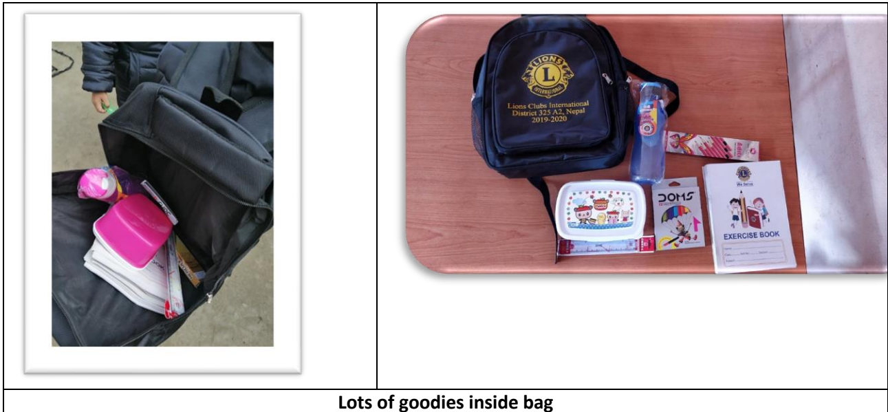
Lots of goodies inside bag