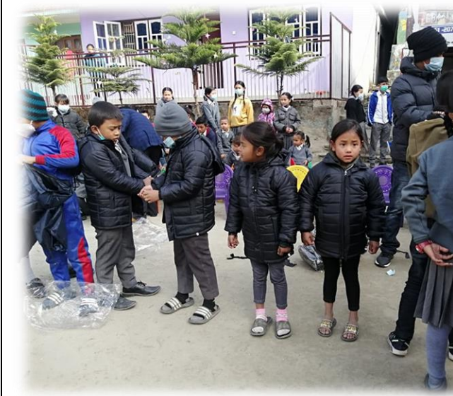
Children trying out Jackets