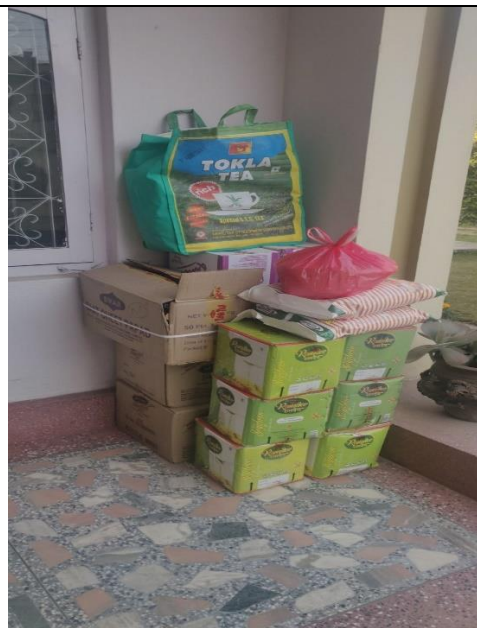
Food Packages Ready to Dispatch