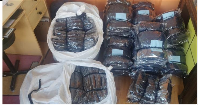
Jacket Packed and Ready to dispatch